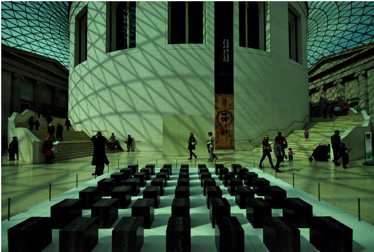
Idris Khan, 2012, Seven time at the Hajj exhibition.

The curatorial role is redefined today to include new and creative dimensions for the narration experience. In this perspective, the space of the British Museum becomes one for interactions and critical reflections between the visitors' private narratives and the museum's own narratives, springing from the objects and the collection, the institution itself and the visitors. The space of the museum then can be described as a threshold for contact between the personal and private within public and formal dimensions. The museum is now described as an instrument of, and as a place for, learning and exercising the practical as well as mental skills for community reform. Thus, it has become the curatorial role to ensure and make accessible flexible structures of memory spaces in order to constitute and provide effective cultural discourses. The curatorial role pushes the museum space beyond the authentic object as the window to the past. The multi-media, theatrical and technological strategies museum curators are deploying today for their