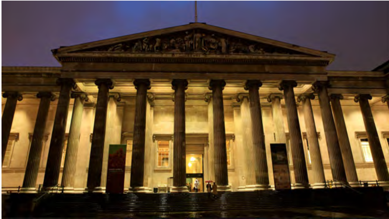
British Museum at night.

positive and constructive presentation of the Middle Eastern region. While this museum is ultimately British it has nevertheless been throughout its time as an institution which simply collected and displayed global material culture and moved towards contributing narratives on open cultural relationships between politically struggling entities. For the British Museum is also part of the World Collections programme formed in 2008. This programme, among other cultural programmes, aims to develop new relationships between worldwide institutions and also to maintain professional development of the organisations involved. Such programmes enable a wide range of skill sharing, providing funding for training and research as well as the loan of exhibitions and different collections. All this feeds into a wider sphere of partnerships combining financial and diplomatic as well as different perspectives on the whole process of display in the museum. This happens through offering a new outsider's view on the collections and exhibitions among other aspects of the museum in focus. The importance of having a new pair