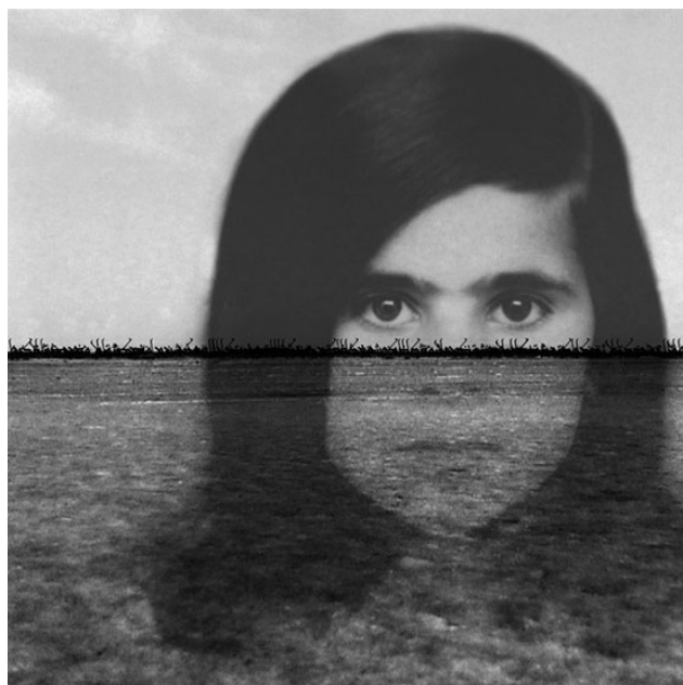
Nicene Kossentini, Yasmina , 2011, digital print on archival paper, 100x100cm.

Museum, explains, it is then the role of cultural relations to act. Venetia Porter is also responsible for developing the collection of the modern and contemporary art of the Middle East. At the British Museum, this particular curator works with a range of museum professionals, educators and researchers across a wide range of areas to re-narrate the complex narratives of the present Middle East. Using art as the tool for enhancing and emphasizing the ‘dream space’ of the museum, Porter has curated several exhibitions devoted to the present and past Middle East, such as: “Word into Art : Artists of the Modern Middle East” in London (2006) and Dubai (2008) and “Hajj: Journey to the heart of Islam” (2012). Furthermore, her publications include Arabic and Persian Seals and Amulets in the British Museum (British Museum Research papers 2011), (Ed.) Hajj: Journey to the heart of Islam and The Art of Hajj (2012), and she is working on a book based on the British Museum’s collection of Middle Eastern art.