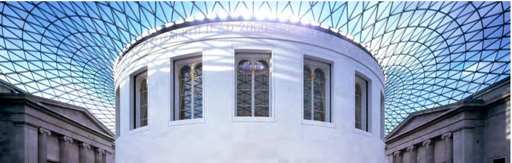
The Great Court of the British Museum.